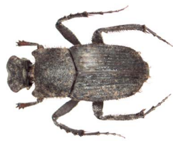
34 Eurysternus nigrovirens SCARABAEIDAE