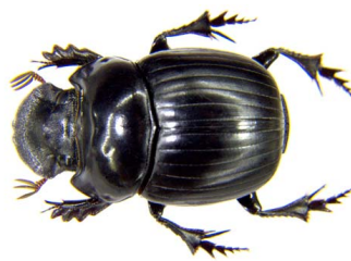
23 Dichotomius mamillatus (F) SCARABAEIDAE