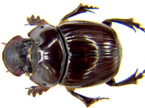
25 Dichotomius ohausi (F) SCARABAEIDAE