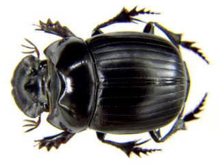
24 Dichotomius mamillatus (M) SCARABAEIDAE