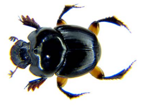
4 Canthidium onitoides SCARABAEIDAE