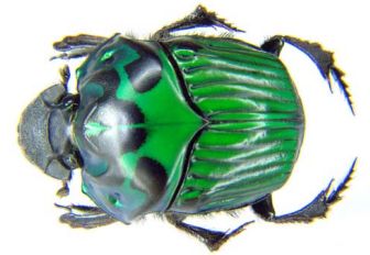
48 Oxysternon conspicillatum (F) SCARABAEIDAE