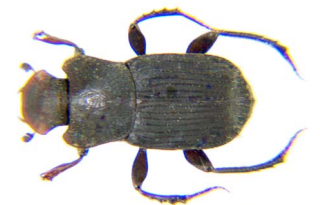
36 Eurysternus vastiorum SCARABAEIDAE