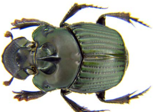
54 Phanaeus bispinus (F) SCARABAEIDAE