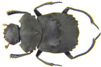
13 Deltochilum carinatum SCARABAEIDAE