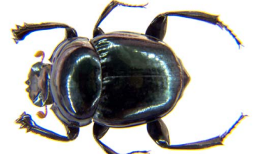
8 Canthon fulgidus SCARABAEIDAE