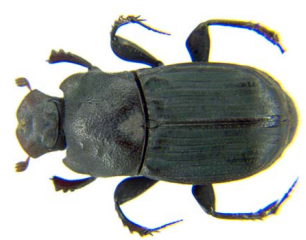
31 Eurysternus foedus SCARABAEIDAE