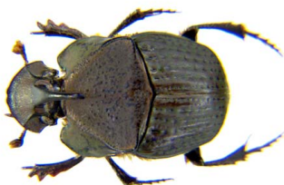
57 Phanaeus cambeforti (M) SCARABAEIDAE