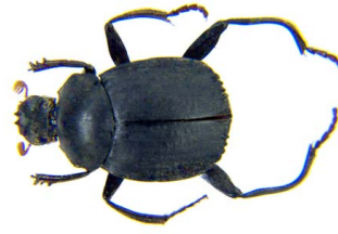
15 Deltochilum larseni SCARABAEIDAE