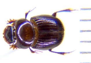
2 Canthidium basipunctatum SCARABAEIDAE