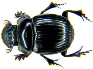
29 Dichotomius worontzowi SCARABAEIDAE