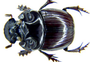
27 Dichotomius prietoi SCARABAEIDAE