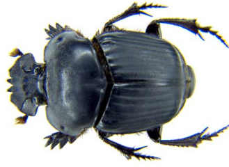
10 Coprophanaeus telamon (F) SCARABAEIDAE