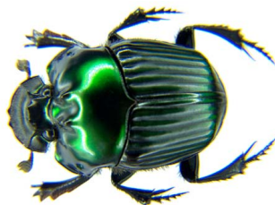
50 Oxysternon silenus (F) SCARABAEIDAE