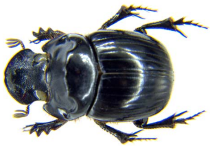
26 Dichotomius ohausi (M) SCARABAEIDAE