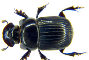
38 Ontherus alexis SCARABAEIDAE