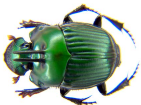
53 Oxysternon spiniferum (M) SCARABAEIDAE