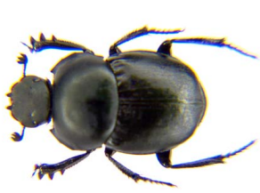
5 Canthon aberrans SCARABAEIDAE