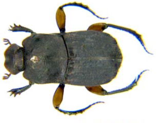
30 Eurysternus caribaeus SCARABAEIDAE