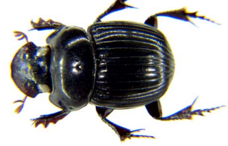
28 Dichotomius robustus SCARABAEIDAE