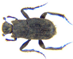
33 Eurysternus lanuginosus SCARABAEIDAE