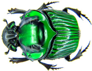
49 Oxysternon conspicillatum (M) SCARABAEIDAE