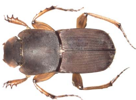
37 Eurysternus wittmerorum SCARABAEIDAE