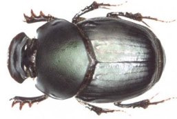
43 Onthophagus osculatii (F) SCARABAEIDAE