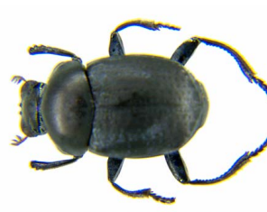
19 Deltochilum peruanum (M) SCARABAEIDAE