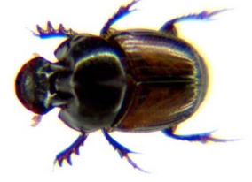
40 Onthophagus haematopus (M) SCARABAEIDAE