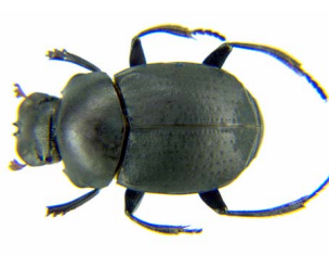
18 Deltochilum peruanum (F) SCARABAEIDAE