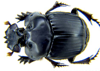
11 Coprophanaeus telamon (M) SCARABAEIDAE