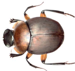
58 Scybalocanthon aereus SCARABAEIDAE