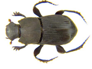
32 Eurysternus hypocrita SCARABAEIDAE