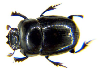
60 Uroxys gorgon SCARABAEIDAE