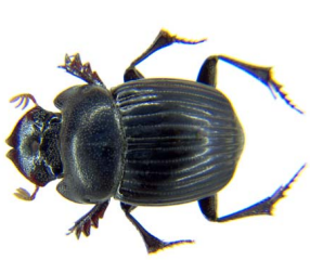
21 Dichotomius batesi SCARABAEIDAE

[fieldguides.fieldmuseum.org] [778] version 1 06/2016