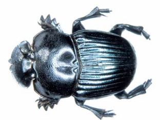
20 Dendropaemon attalus SCARABAEIDAE