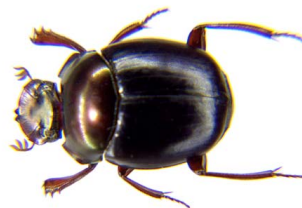
59 Sylvicanthon bridarollii SCARABAEIDAE