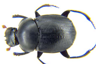
14 Deltochilum howdeni SCARABAEIDAE