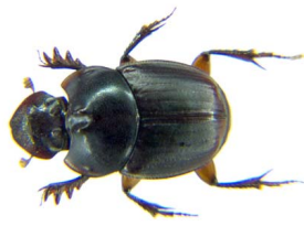
46 Onthophagus xanthomerus (F) SCARABAEIDAE