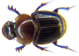
41 Onthophagus onorei (F) SCARABAEIDAE

[fieldguides.fieldmuseum.org] [778] version 1 06/2016