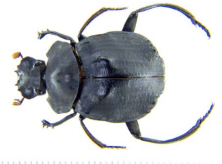
12 Deltochilum amazonicum SCARABAEIDAE