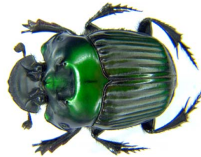
51 Oxysternon silenus (M) SCARABAEIDAE