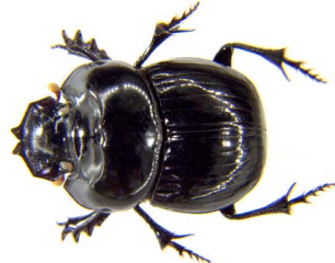
22 Dichotomius cf. fonsecae (M) SCARABAEIDAE