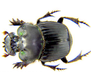
9 Coprophanaeus larseni (M) SCARABAEIDAE