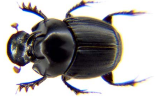
44 Onthophagus osculatii (M) SCARABAEIDAE