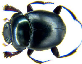
6 Canthon aequinoctialis SCARABAEIDAE