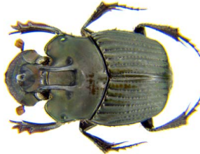
55 Phanaeus bispinus (M) SCARABAEIDAE