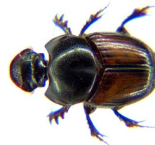
39 Onthophagus haematopus (F) SCARABAEIDAE