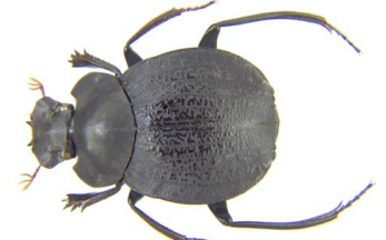
16 Deltochilum orbiculare (F) SCARABAEIDAE