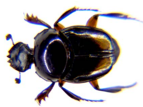
7 Canthon femoralis SCARABAEIDAE