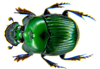
52 Oxysternon spiniferum (F) SCARABAEIDAE