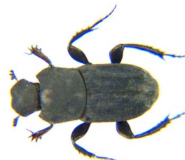
35 Eurysternus plebejus SCARABAEIDAE