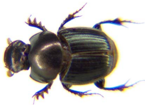
45 Onthophagus rubescens (F) SCARABAEIDAE