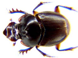
47 Onthophagus xanthomerus (M) SCARABAEIDAE