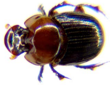
42 Onthophagus onorei (M) SCARABAEIDAE