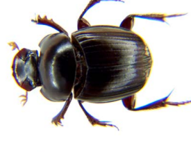
3 Canthidium lentum SCARABAEIDAE