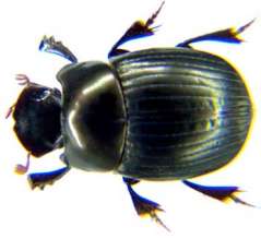
1 Ateuchus connexus SCARABAEIDAE

[fieldguides.fieldmuseum.org] [778] version 1 06/2016