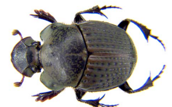
56 Phanaeus cambeforti (F) SCARABAEIDAE